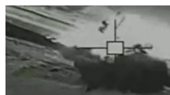
The impact of air strikes against Islamic State