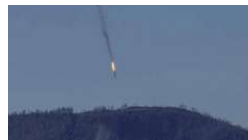
Turkey-Russia war of words over jet