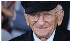
Nuremberg's last surviving prosecutor