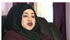
Metro passengers intervene as woman suffers racial abuse