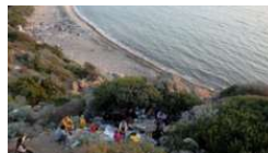
Children die as boats sink off Turkey