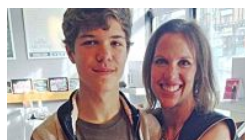
Police urged to review handling of grooming cases