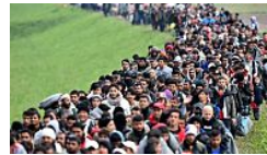
Norway is using Facebook to send a stark message to migrants