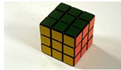
Rubik's record-breaking teen reveals his secret