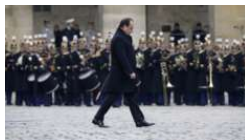
France holds memorial for Paris victims